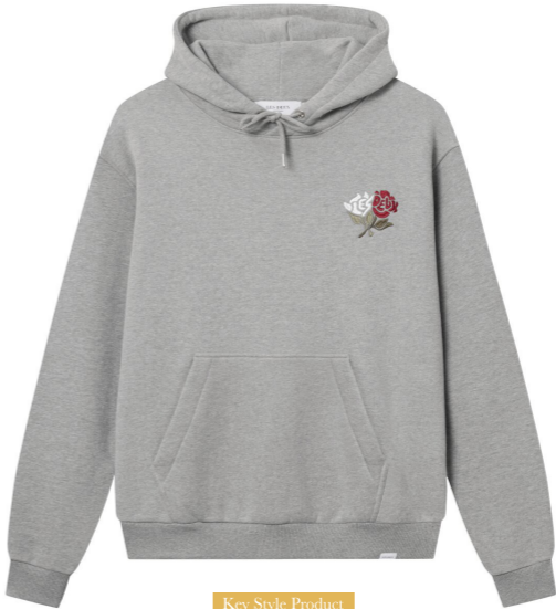
Key Style Product