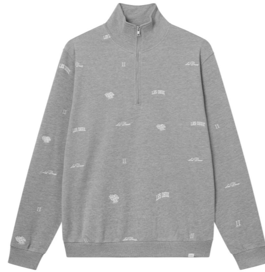
Dwayne AOE Half-Zip Sweatshirt - Light Grey Mélange/Light Ivory

Made in: Delivery: Style No. Size set India Oct - Nov LDM202023 XS - XXL