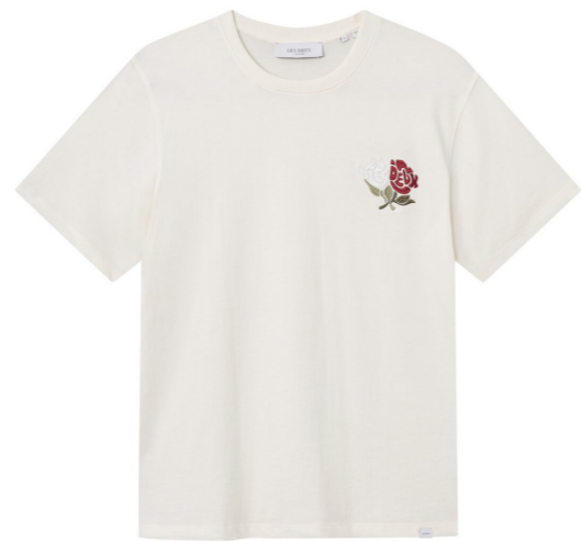
Felipe T-Shirt - Light Ivory

Made in: Delivery: Style No. Size set India Oct - Nov LDM101157 XS - XXL