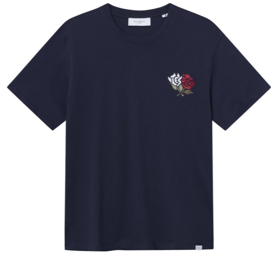
Felipe T-Shirt - Dark Navy

Made in: Delivery: Style No. Size set India Oct - Nov LDM101157 XS - XXL