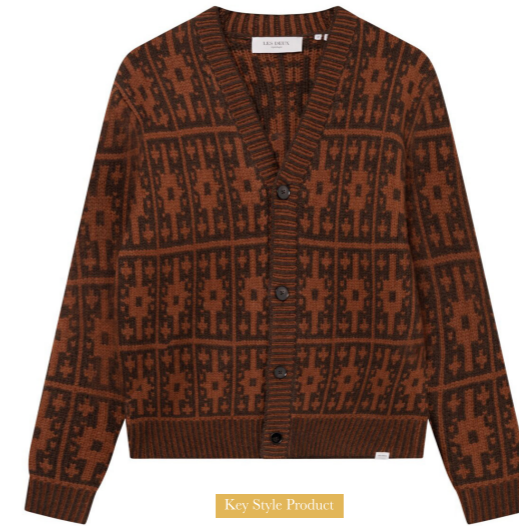
Key Style Product