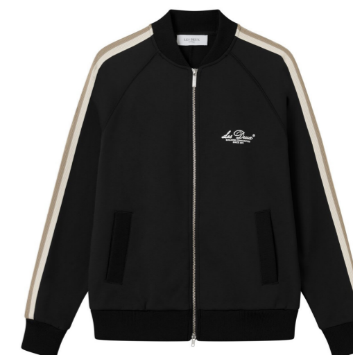
Sterling Track Jacket - Black/Ivory

Made in: Delivery: Style No. Size set China Oct - Nov LDM610120 XS - XXL