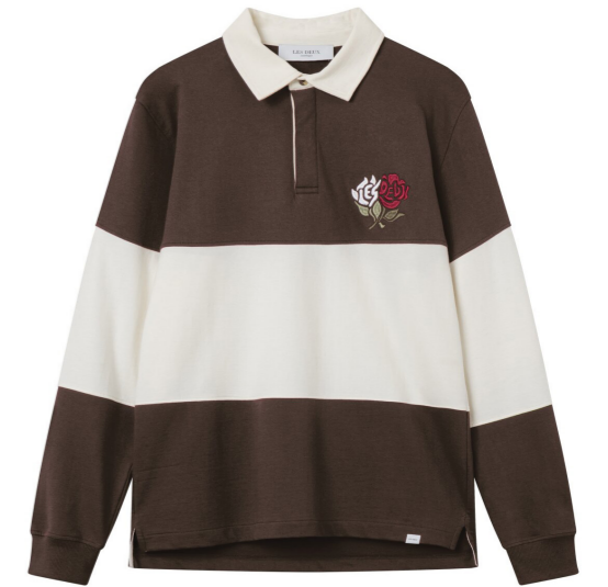
Felipe LS Rugby T-Shirt - Coffee Brown/Light Ivory

Quality: 100% Cotton Heavy cotton rugby shirt with twill collar and flower embroidery on chest