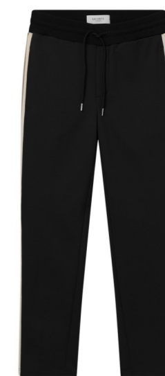
Sterling Track Pants - Black/Ivory

Made in: Delivery: Style No. Size set China Oct - Nov LDM530046 XS - XXL