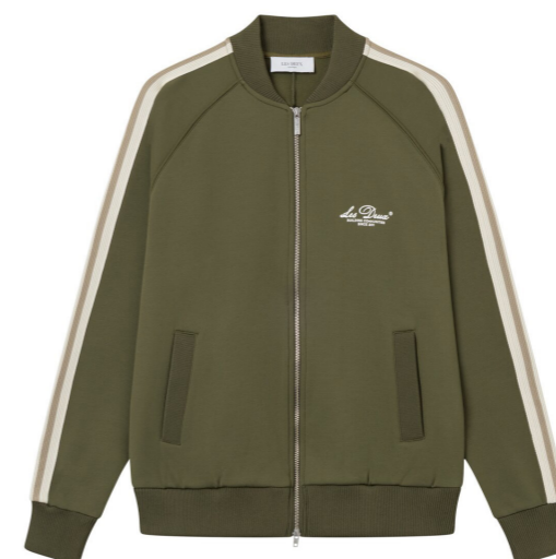
Sterling Track Jacket - Olive Night/Ivory

Quality: 100% Polyester Technical track jacket with two-way zipper and knitted tape details