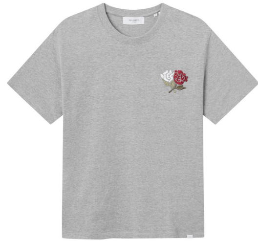
Felipe T-Shirt - Light Grey Mélange

Quality: 100% Cotton Soft cotton T-shirt with flower embroidery on chest