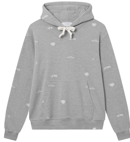
Dwayne AOE Hoodie - Light Grey Mélange/Light Ivory

Quality: 100% Cotton Dry cotton hoodie with all-over embroidery