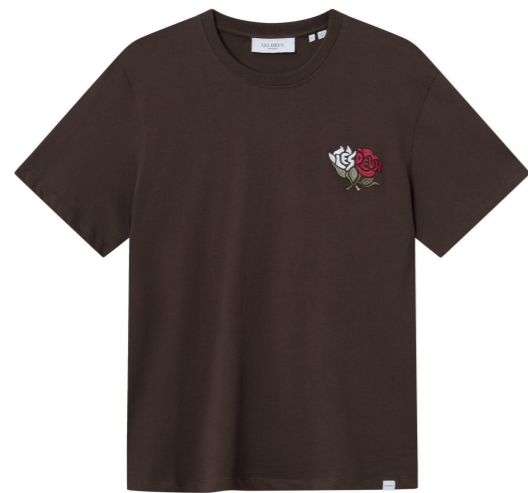
Felipe T-Shirt - Coffee Brown

Made in: Delivery: Style No. Size set Turkey Oct - Nov LDM101158 XS - XXL