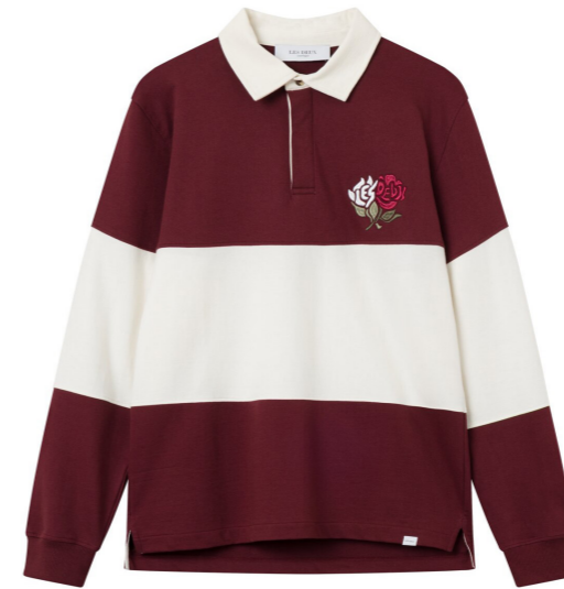
Felipe LS Rugby T-Shirt - Shiraz/Light Ivory

Quality: 100% Cotton Heavy cotton rugby shirt with twill collar and flower embroidery on chest