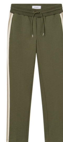
Sterling Track Pants - Olive Night/Ivory

Made in: Delivery: Style No. Size set China Oct - Nov LDM610120 XS - XXL