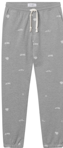
Dwayne AOE Sweatpants - Light Grey Mélange/Light Ivory

Made in: Delivery: Style No. Size set India Oct - Nov LDM200141 XS - XXL